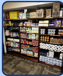
Friends of The Library Pantry est. October 2025